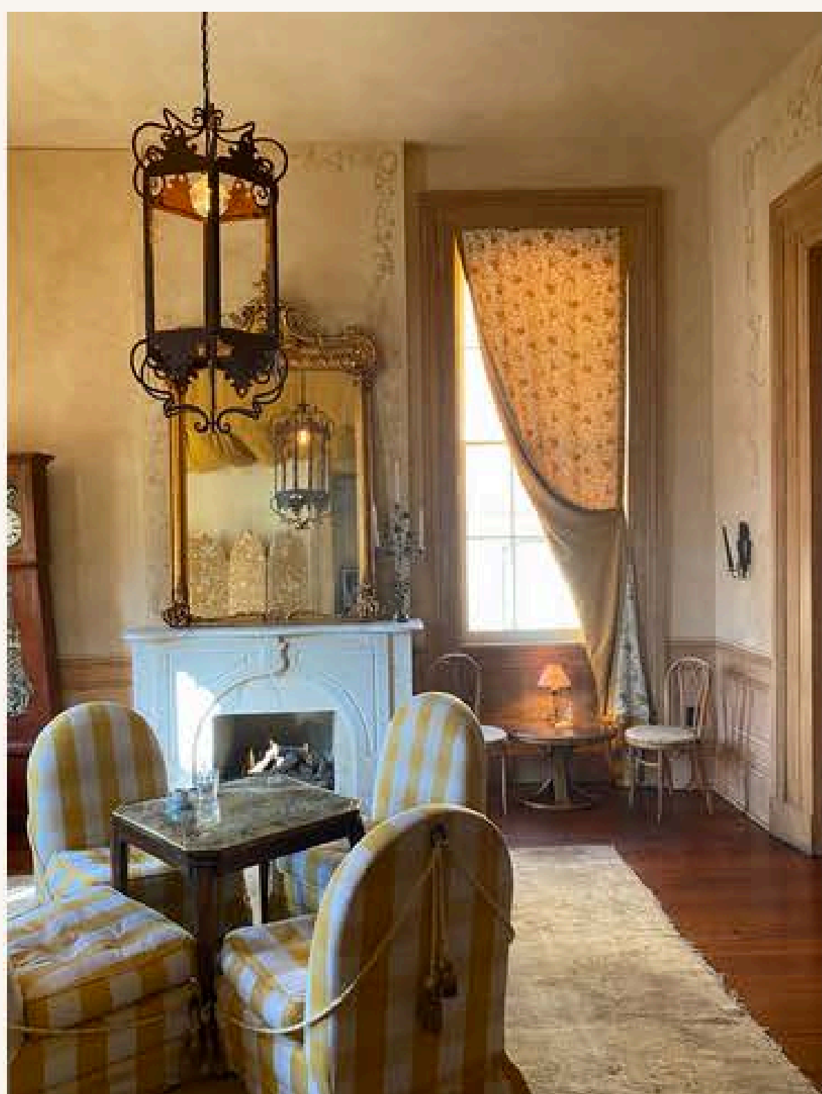
Hotel Peter & Paul