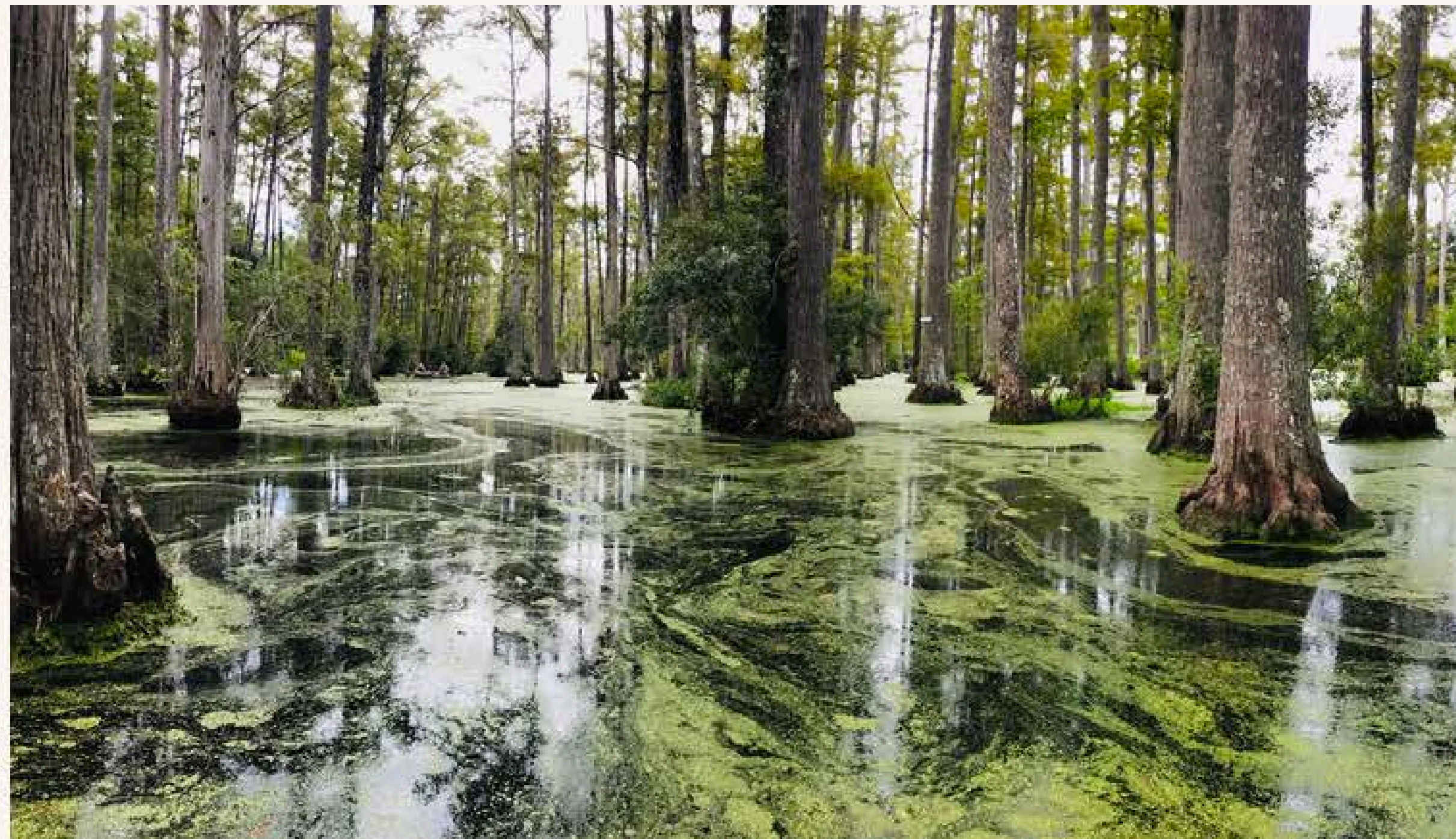
Cypress Gardens - filming location of "The Notebook"