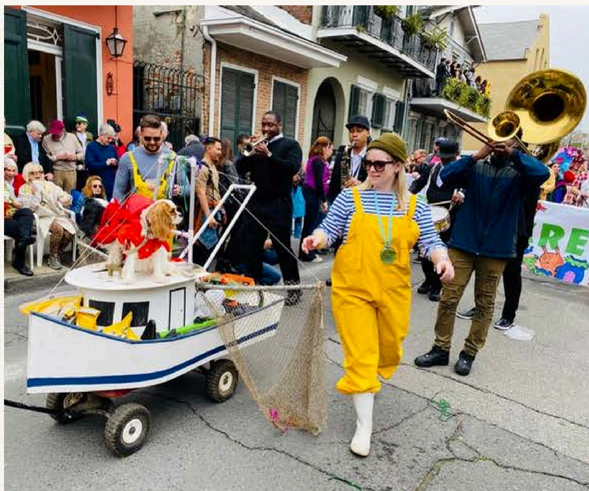
A Dog Parade in New Orleans