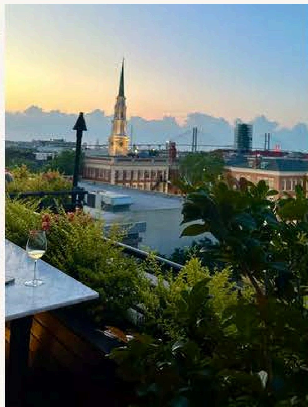
Perry Lane Rooftop